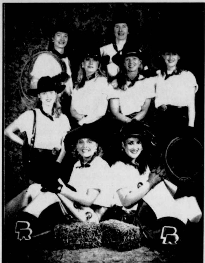
Power Rents Rodeo Team

The Power Rents Rodeo Team, who will appear at the Oregon Trail Pro Rodeo Saturday, August 16, in Heppner, has been entertaining fans at parades and rodeos throughout the Northwest for over 10 years.