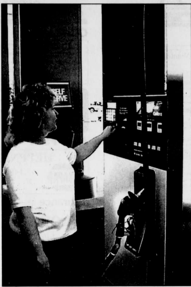
Store manager shows newly-installed pumps