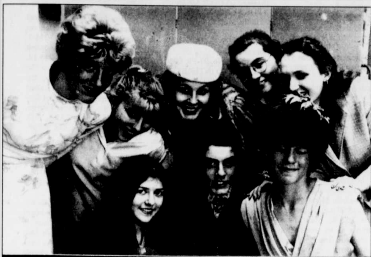
Cast of "Here Come the Brides", Ione Drama Club play May 3-4

"When a man marries, his troubles begin" is the topic of the Ione Drama club presentation set Saturday, May 3 at 7 p.m. and Sunday, May 4, at 2 p.m. at the Ione High School cafeteria.