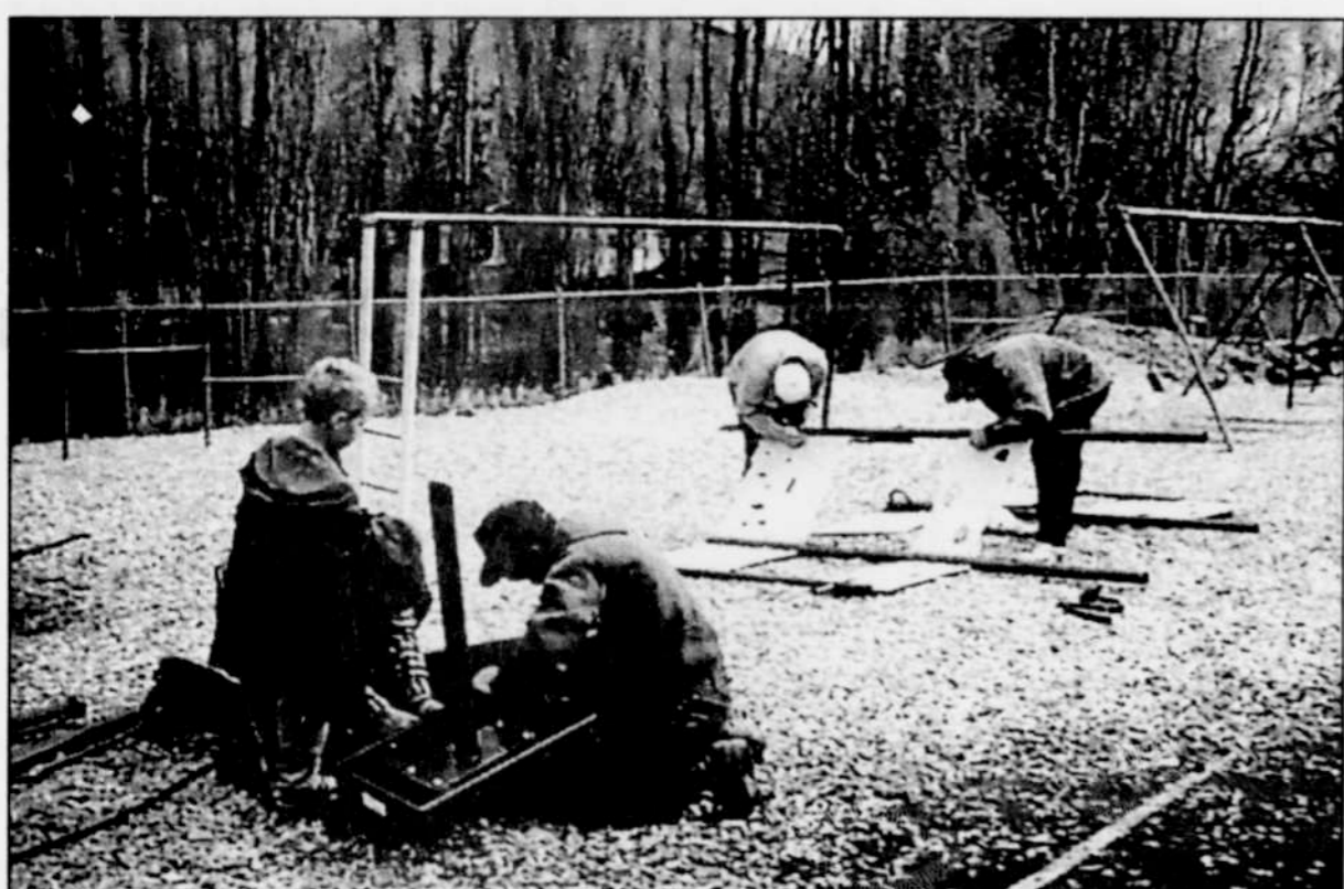
Volunteers assemble playground at Heppner Elementary School