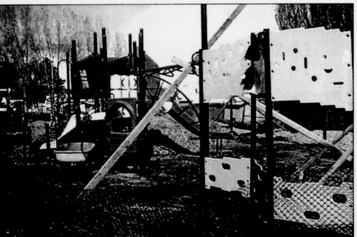
Almost finished-just waiting for the cement to set.

Heppner Elementary School children are eagerly awaiting April 23. That's the day they will be able to try out the new playground equipment that was installed at the school Friday, April 18.