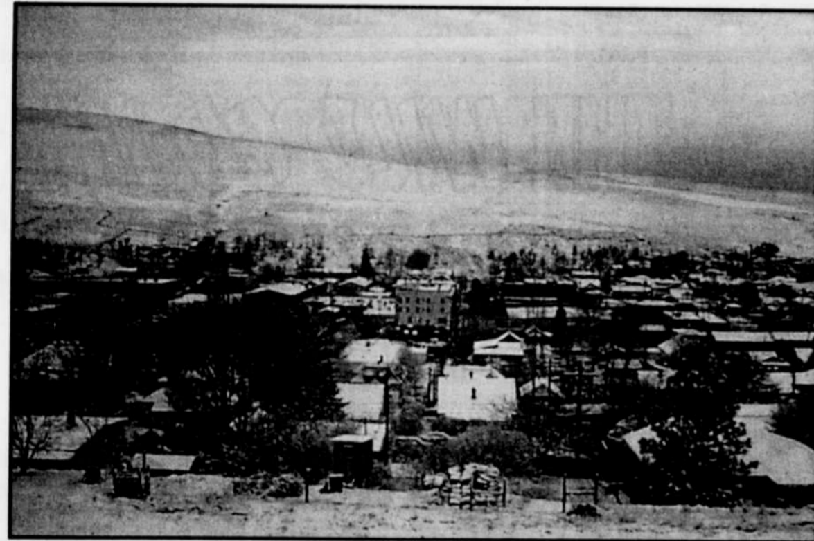
Heppner was a picture postcard, blanketed with snow on Friday, April 4

Other dates to remember are as follows: Tues. and Thurs., exercise, 10 a.m.; Wed., blood pressure clinic, 11 a.m., senior meal, noon; Friday, cards 2 p.m.; Sunday, movie, 7 p.m.