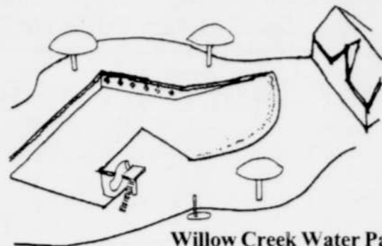
Willow Creek Water Park

Help us meet our $50,000 goal: buy a brick or join the Wall of Fame.