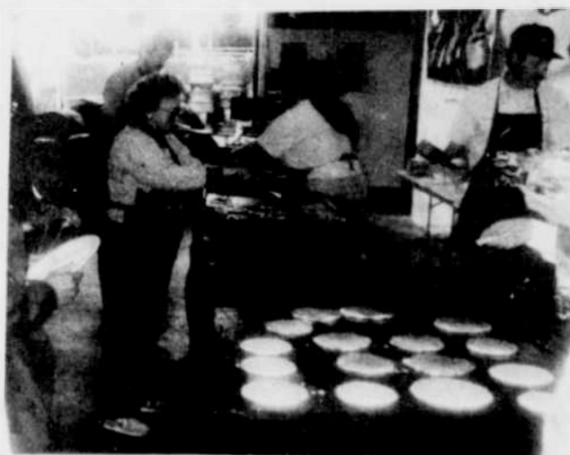
FREE PANCAKE BREAKFAST