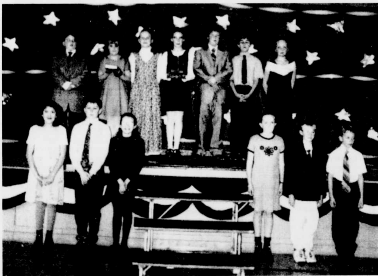
Lone Elementary School holds their presidential inauguration

Lone Elementary School students in kindergarten through fifth grade celebrated U.S. history by holding a presidential inauguration at the school for family and friends on Friday, January 24.