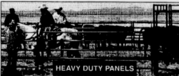
HEAVY DUTY PANELS

Ask about these other HiQual Products for the Calving Season