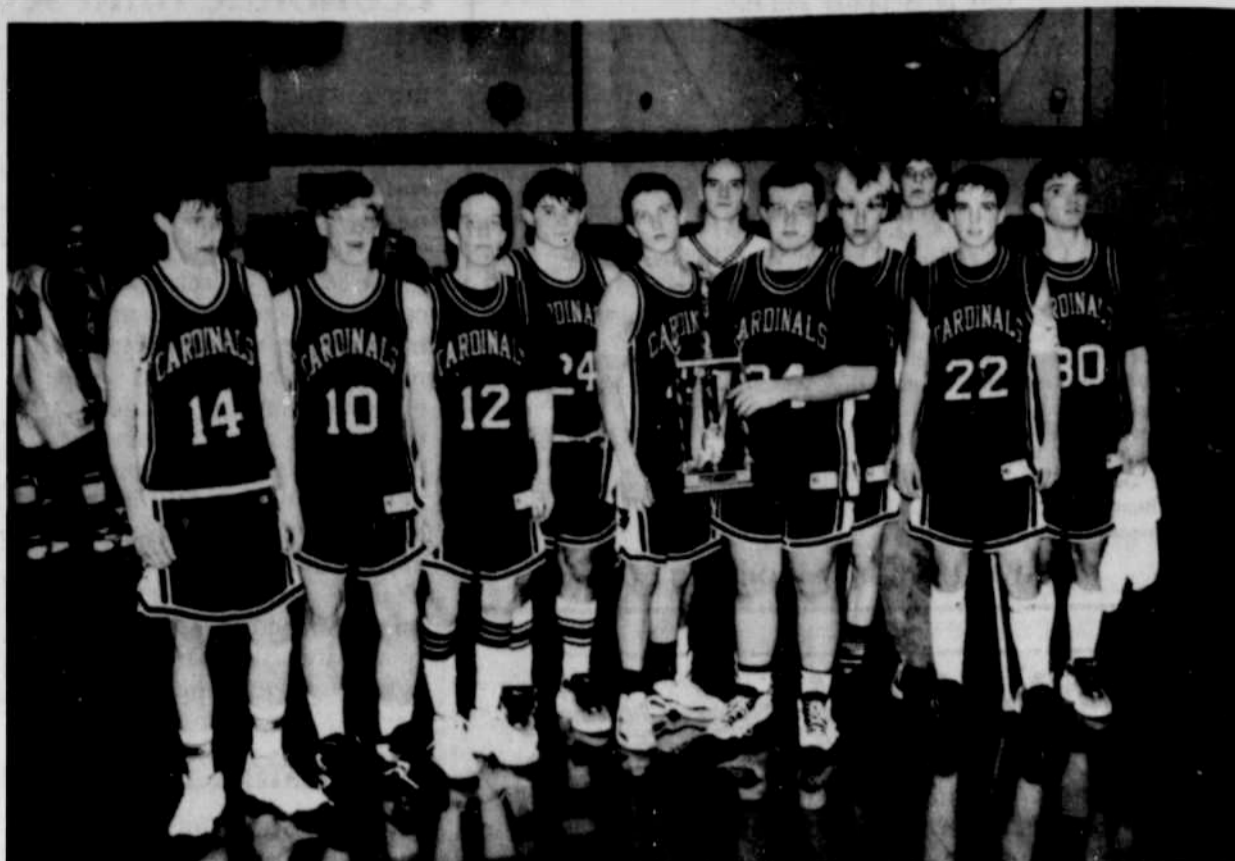
Ione Cardinals collect first place Wasco County Tournament trophy

The Ione Cardinals got off to a slow start in the championship game of the Redside Tournament on Saturday, Dec. 21 at Maupin, but the Cards came on strong in the second quarter and breezed to a 69-48 win.