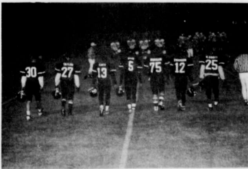
All the seniors take the field at the start of the game

The Ione Cardinals finished their 1996 football season in style by beating the Wasco County Redsides, 60-24.