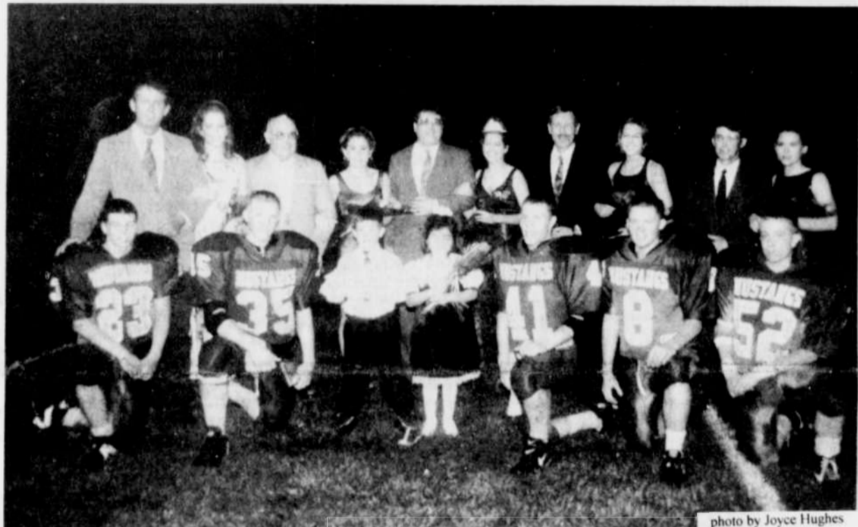
The Heppner High School Homecoming Court reigned over this year's activities including the football game, which the Mustangs won, and the dance which followed. Pictured above is the court along with the girls' fathers.