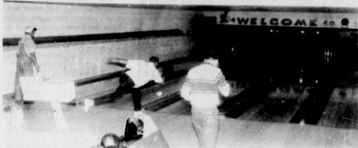
Bowlers try out the newly opened lanes.