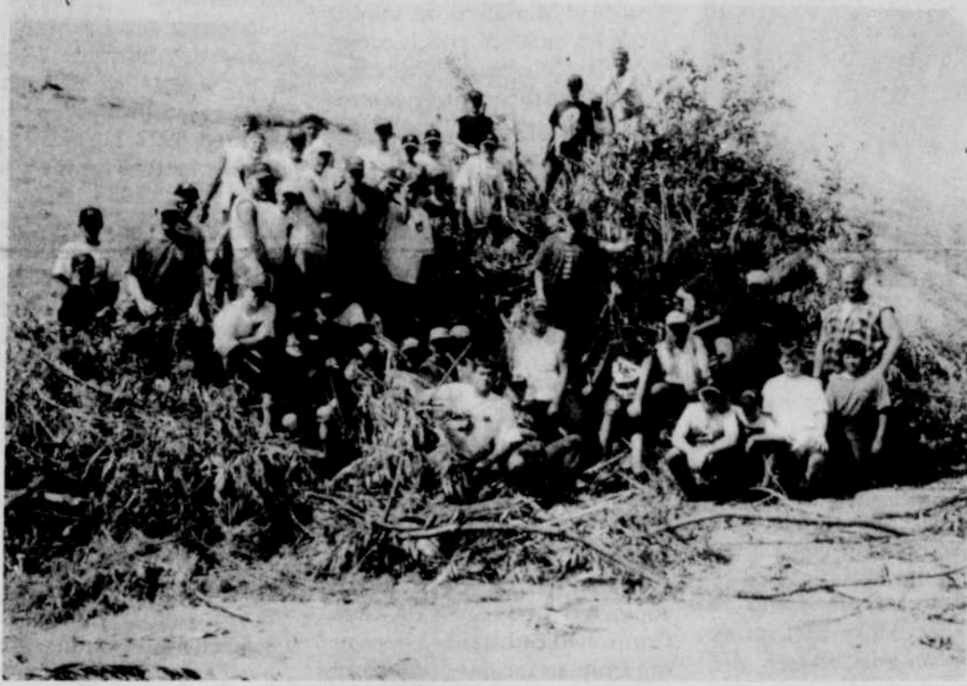
Members of the creek cleaning crew show the pile of brush pulled out of Willow Creek on Sunday. The creek cleaning was done as a joint money raising project by the Wildhorse Club and the Heppner Lions Club. The project is funded by the U.S. Army Corps of Engineers as a flood protection measure.