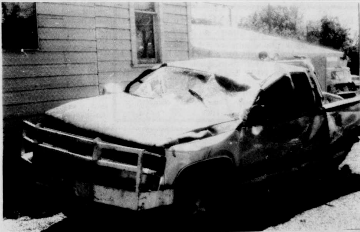
Extensive damage to 1991 chevy pickup

Accounts have been established at the Bank of Eastern Oregon for each of the families of the teenagers involved in the automobile accident. Those who would like to donate money toward the families' lodging, travel, food and other expenses may do so at the BEO.