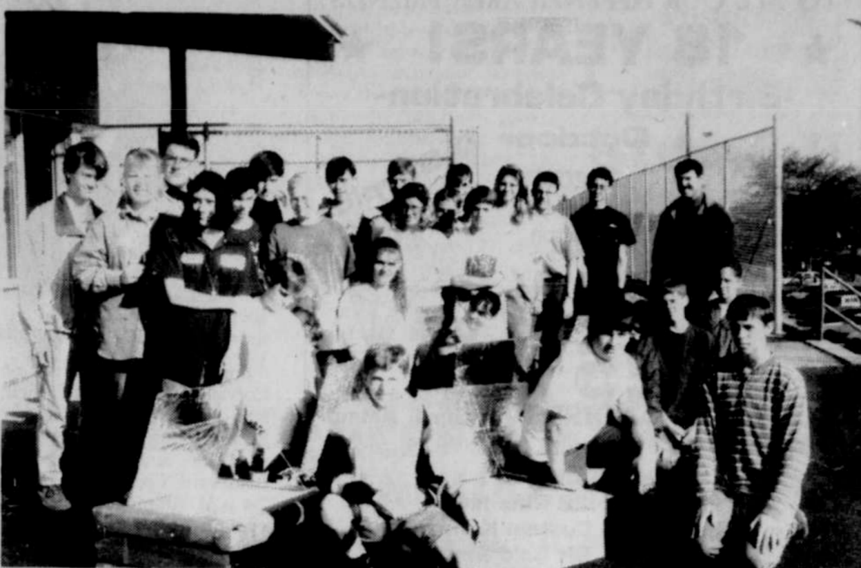
Heppner Junior High students demonstrate homemade solar cookers