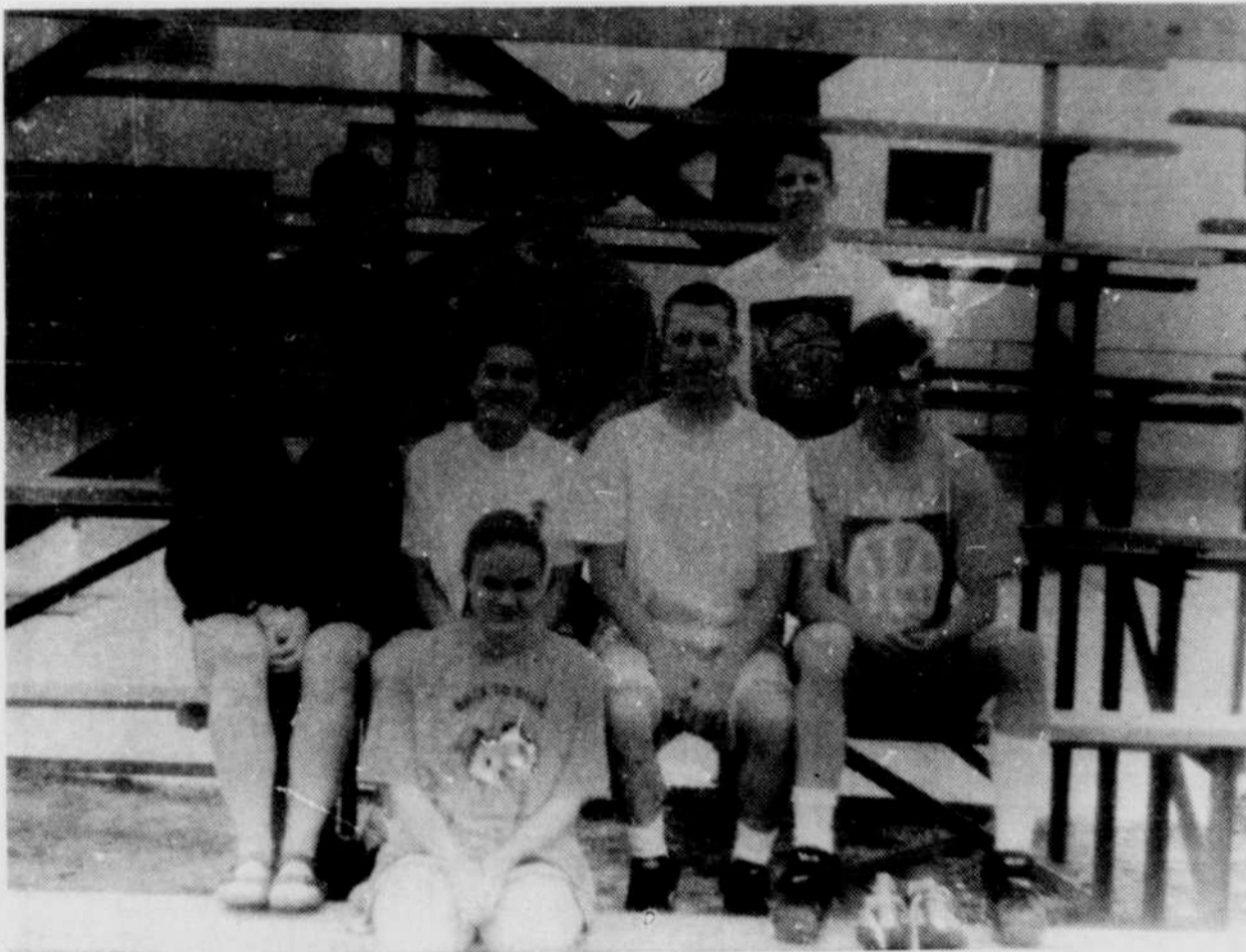
lone track team