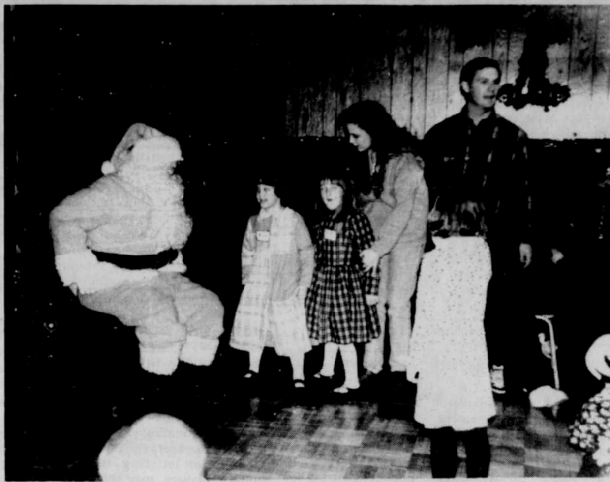
Area children visit with Santa while their parents take advantage of some free time for Christmas shopping Sunday, Dec. 17, at the Heppner Elks Club. The annual lunch with Santa is sponsored by the Heppner Chamber of Commerce.