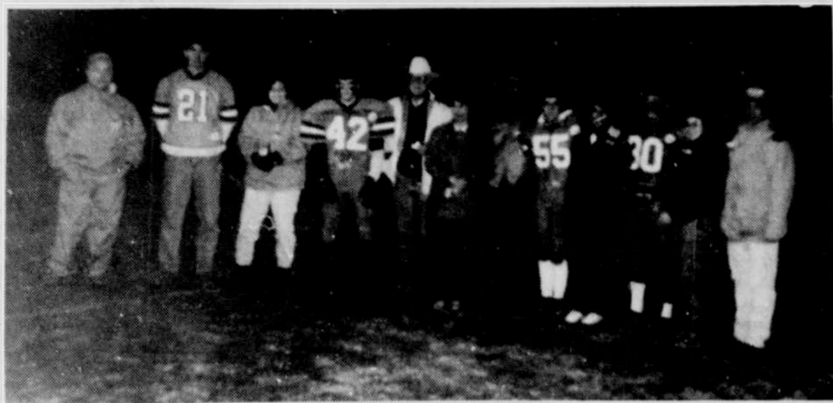
Graduating senior football players and their parents.

The Lone Cardinals ended their season with a win Friday, November 3, pouncing Wheeler, 43-36, to finish third in the tough Big Sky conference. The Cards finished the season 3-2 in league, and 5-3 overall. Their only league losses came at the hands of number one ranked Dufur and number two ranked Culver. Their only other loss was to the number one ranked Washington team, Touchet.