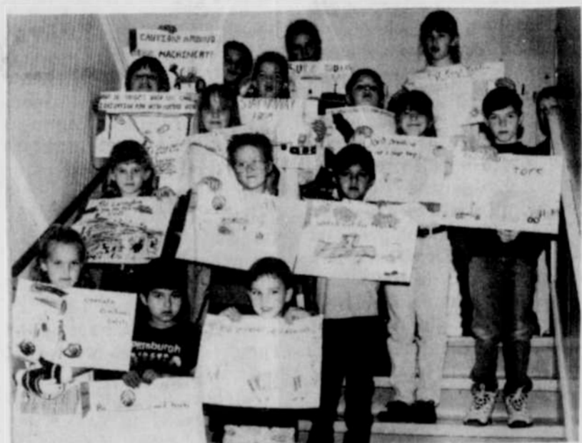
Lone Elementary students pose with winning farm safety posters.