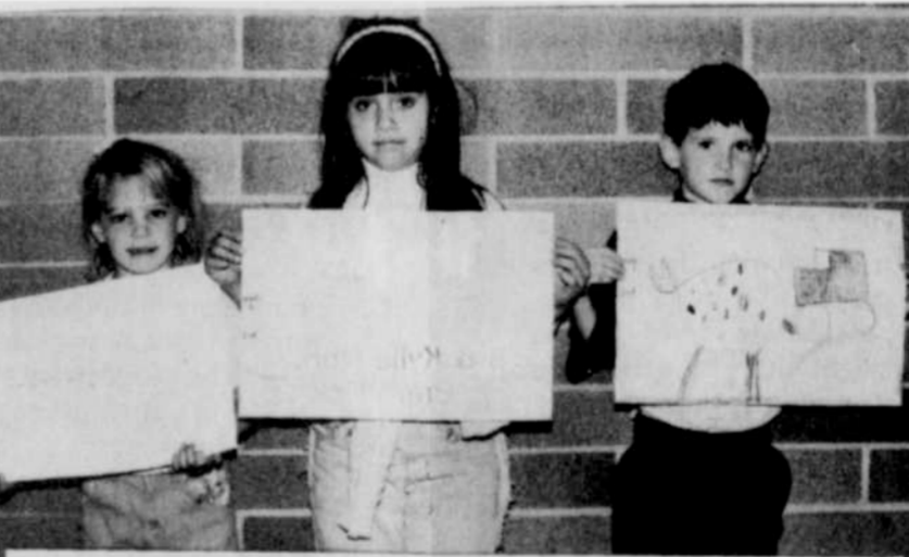
Sam Boardman Elementary students with their winning posters.