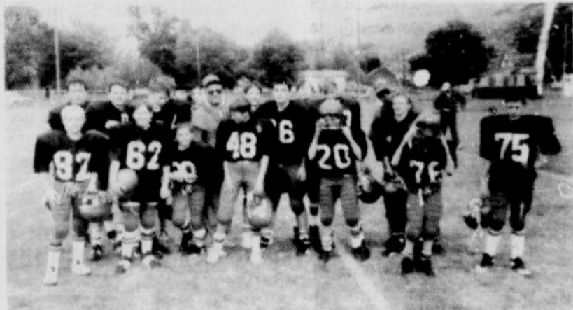
Lone Middle School football team

The 16 member Lone Middle School Football team have had a three win, two loss season this year.