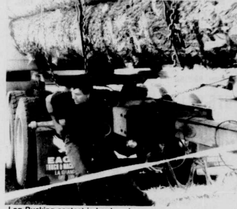
Log Bucking contest is hard work

Everyone is invited to the fairgrounds, Sunday, August 20, to watch the annual amateur log bucking and wrapper throwing contest. The contest begins at 10:30 a.m.