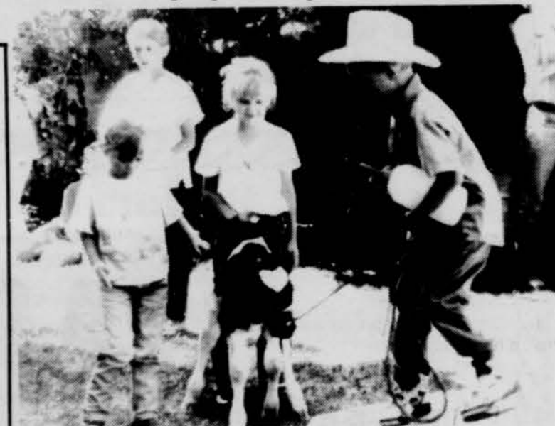
The pet show is a popular event at the fair

A popular activity at the fair again this year will be the Pet Show. As in past years, it will be held on Wednesday, August 16, at 1:30 p.m. A pet and owner dress-alike contest will follow.