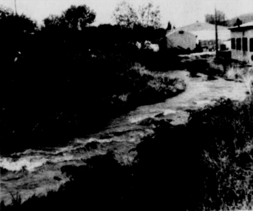
Increased releases from Willow Creek Dam raise creek levels

The Corps has not been forced to release significant amounts of water to control flooding on Willow Creek since March 1993. That year, 250 cfs were released for several days.