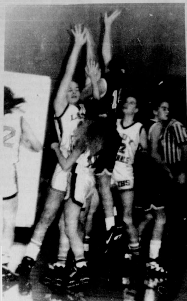
Lady Cardinals block a shot against a Heppner Filly last Saturday night in lone. The Fillies lost their season opener to the Cardinals 49-52.