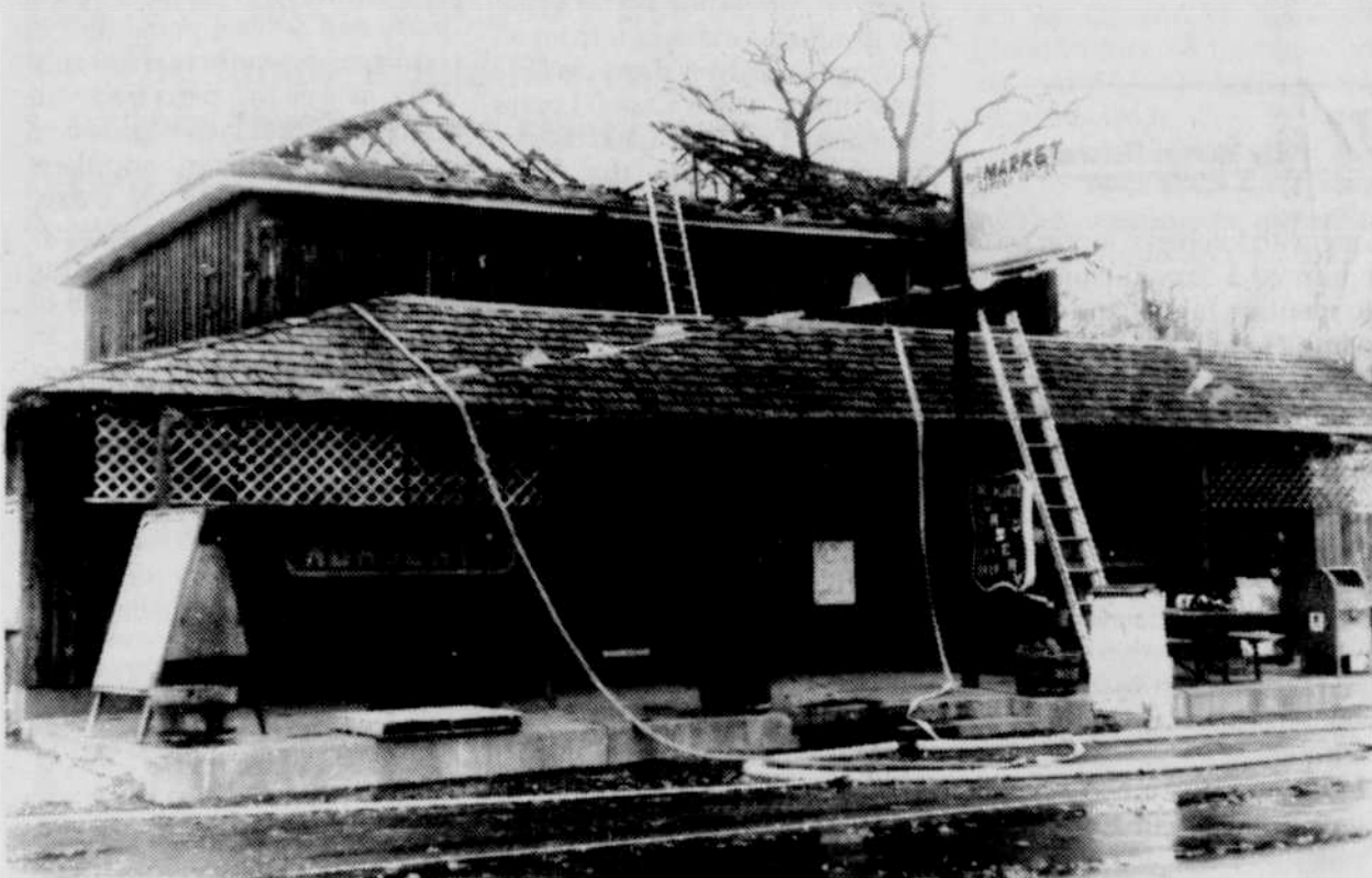
Ladders and hoses cover burned market