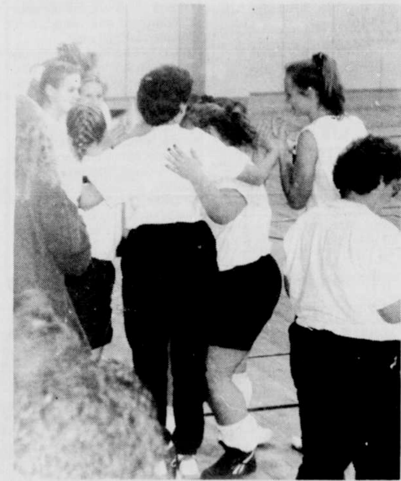
Cardinals celebrate victory