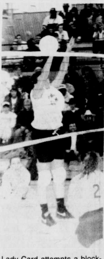
Lady Card attempts a blocked shot