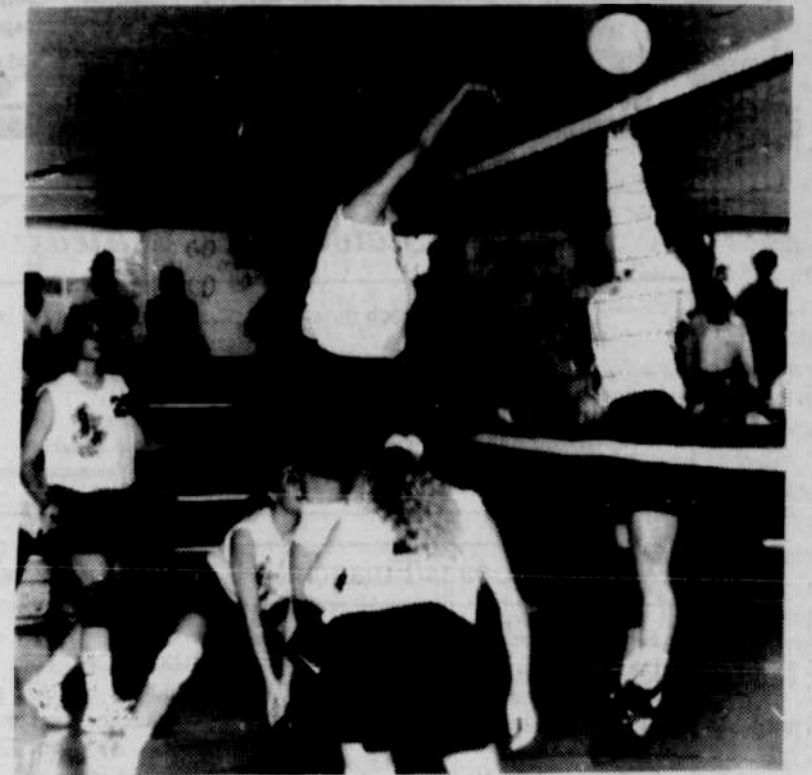
Lady Cards in action against Echo