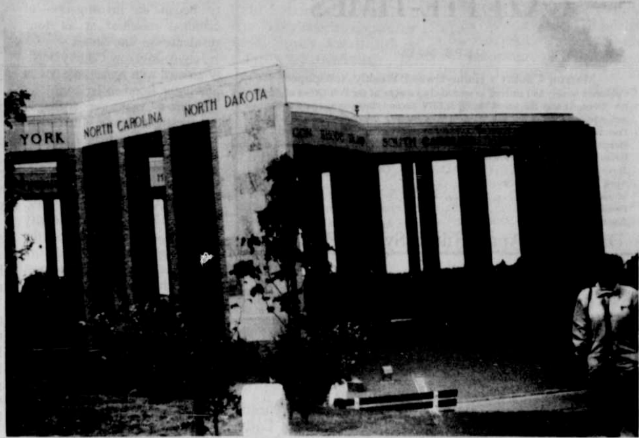
Memorial at Bastogne