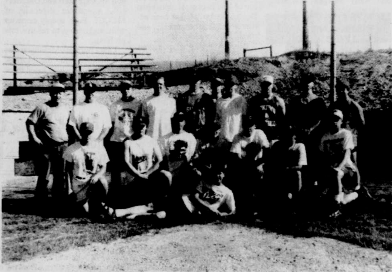
Heppner Mustang team, district champs

Heppner High School's baseball team will give the hometown fans a chance to see its district-champion skills, in action when it squares off against Elgin this Friday at 4:30 p.m. at home.