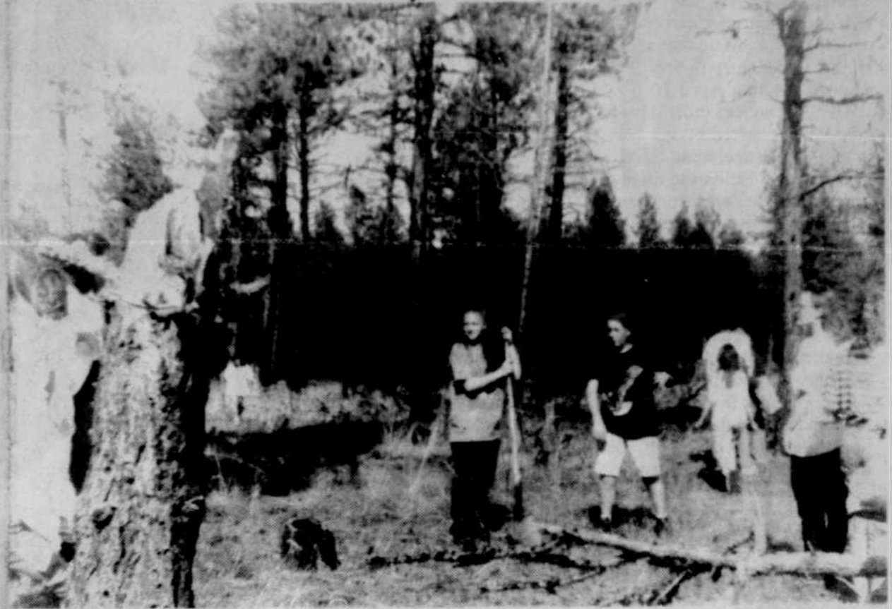
Heppner's seventh graders and Centennial's eighth graders learned how to plant trees on one of their many field trips during the week.