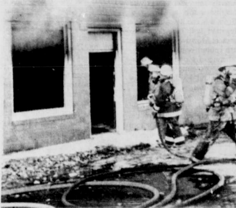
Firemen go into burning apartment during practice burn in Ione Saturday. Sixty-five firemen took part.