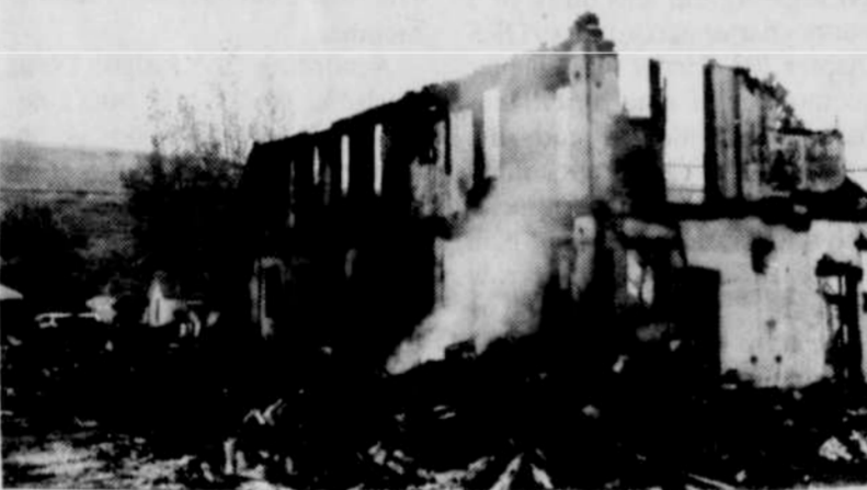
Apartment was later allowed to burn down