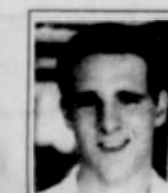
Jason Sales & Service

WINTER CHECK LIST ✓ Traction Tires ✓ Snow Flex® ✓ Studs ✓ Chains ✓ Snow Wheels ✓ Batteries