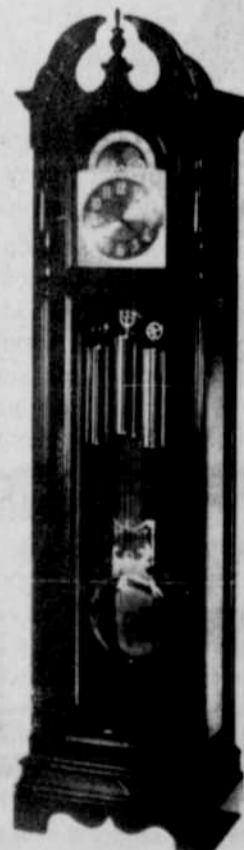
Chateau Westminster Chimes