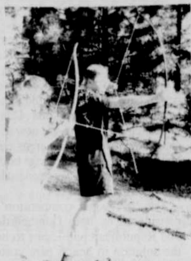
Learning to survive: Archery shooting and finding food to eat in the wilderness were a part of tupper.