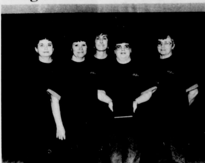
The Sparetimers Bowling League recently honored its top bowling teams. Awards were given for the first and second place teams.