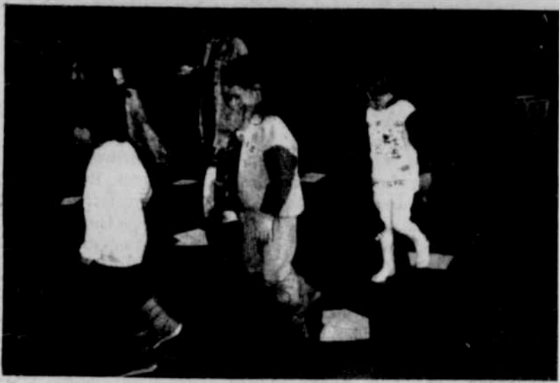
Grade schoolers do the cakewalk

Ione elementary students kindergarten through fifth grades celebrated "Black History" month with a special assembly. Classes studied famous black Americans during the month of February.