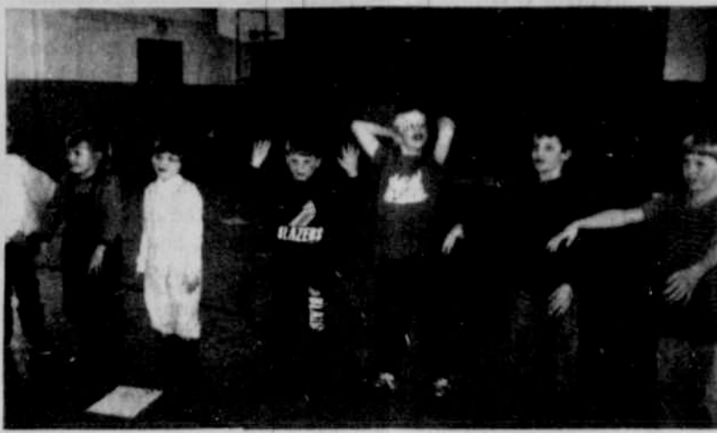
First graders dance the Hokey Pokey

troduce the book and the cakewalk as part of the month's study.