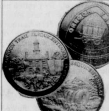
and win These Silver Coins