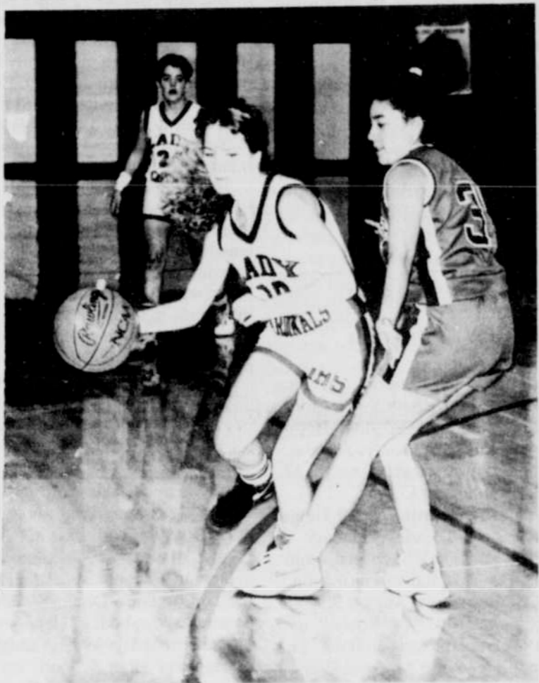
Lady Cardinal drives on Dufur more competition," he added. This weekend the Cards host Arlington on Friday and travel to Condon on Saturday.