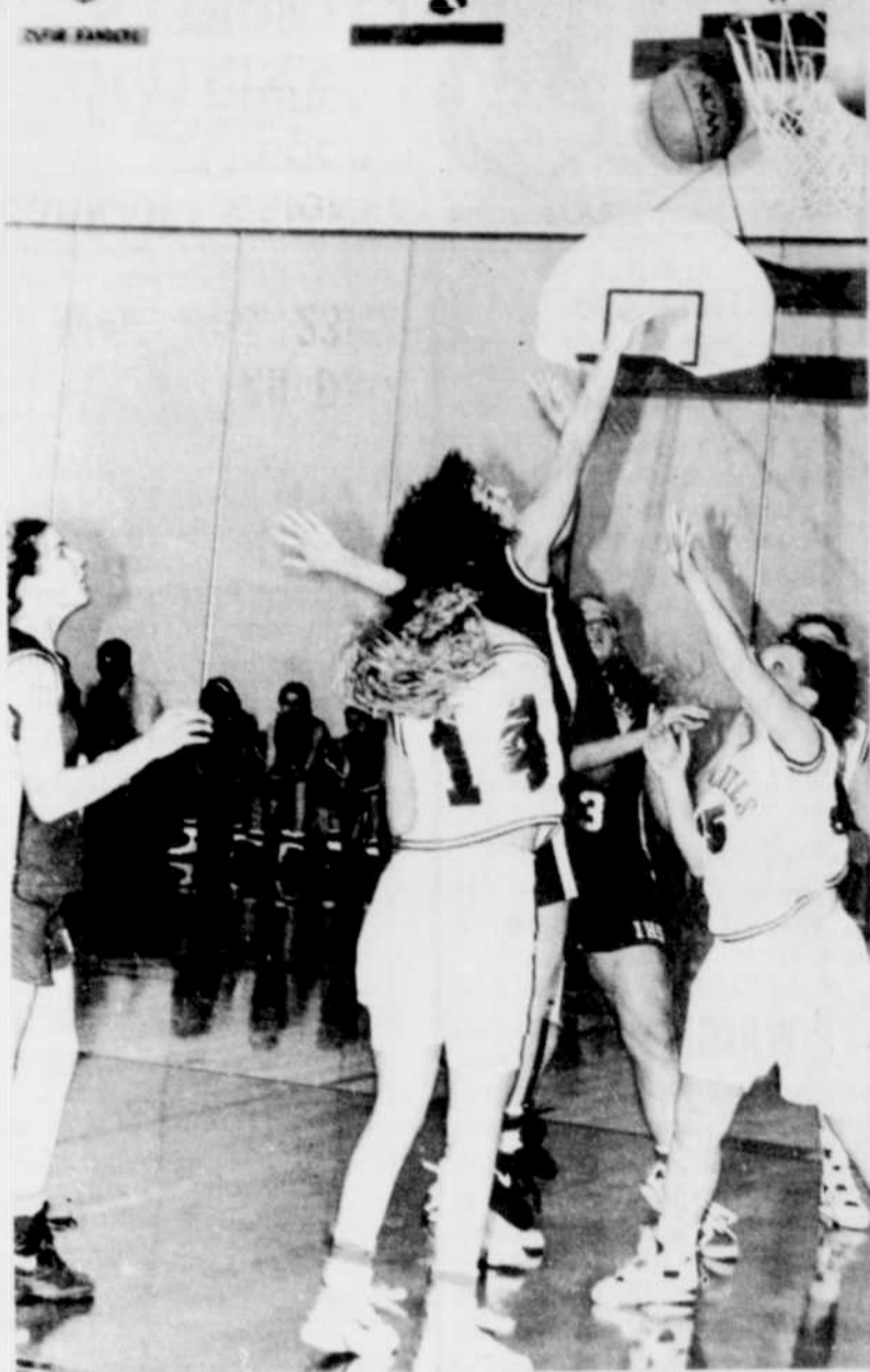
Lady Cards battle Blue Devils