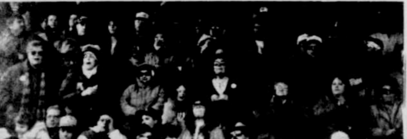
Mustang fans get excited during game