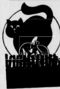
Light-up facie decorations

We have ghoulish greeting cards and decorations by Hallmark