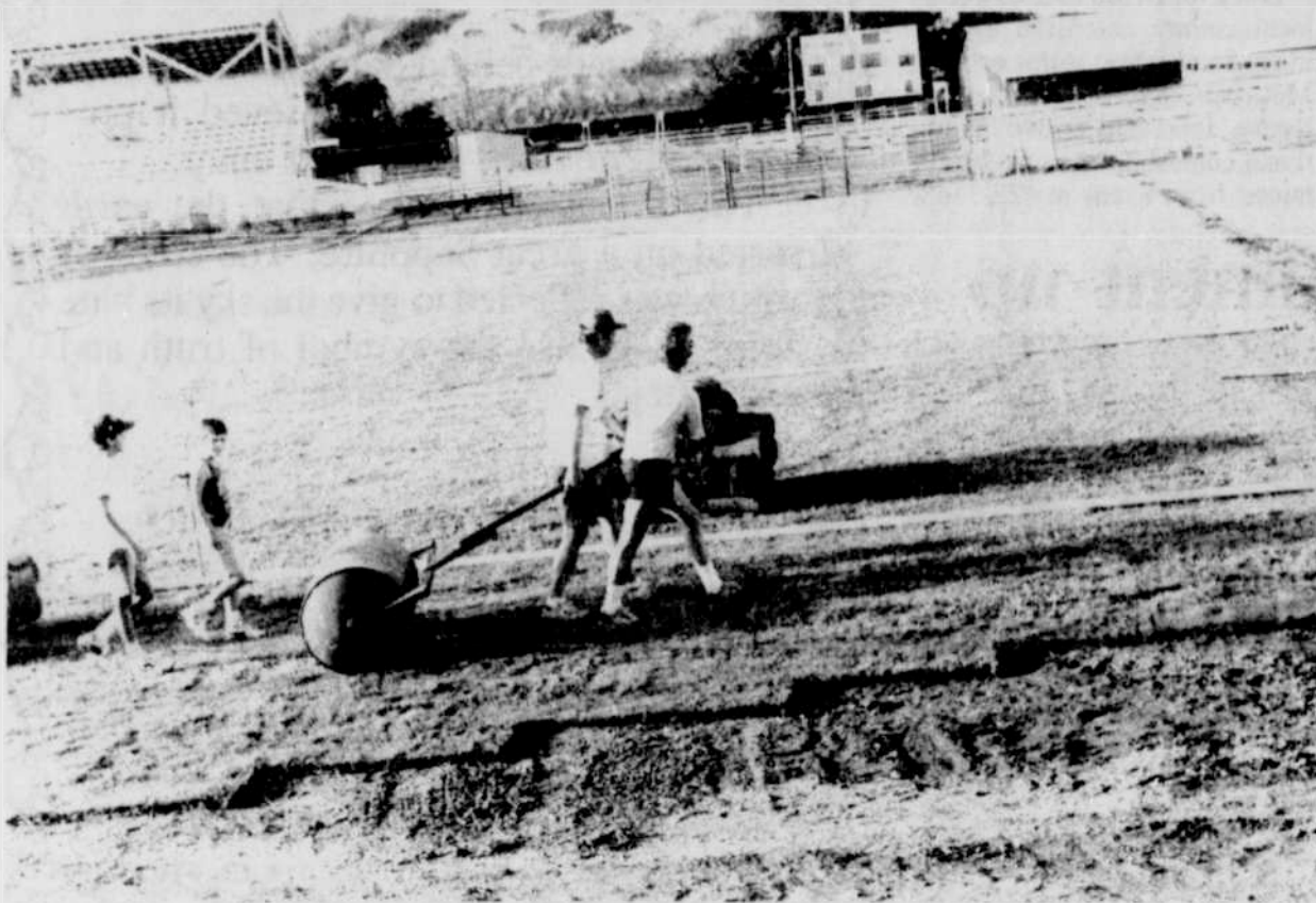
Volunteers use roller to lay new sod at fairgrounds last Wednesday

The first phase of the Morrow County fairgrounds master plan is underway.