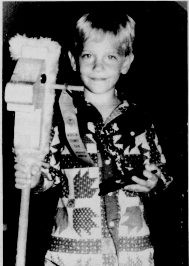
One of last year's stickhorse race winners