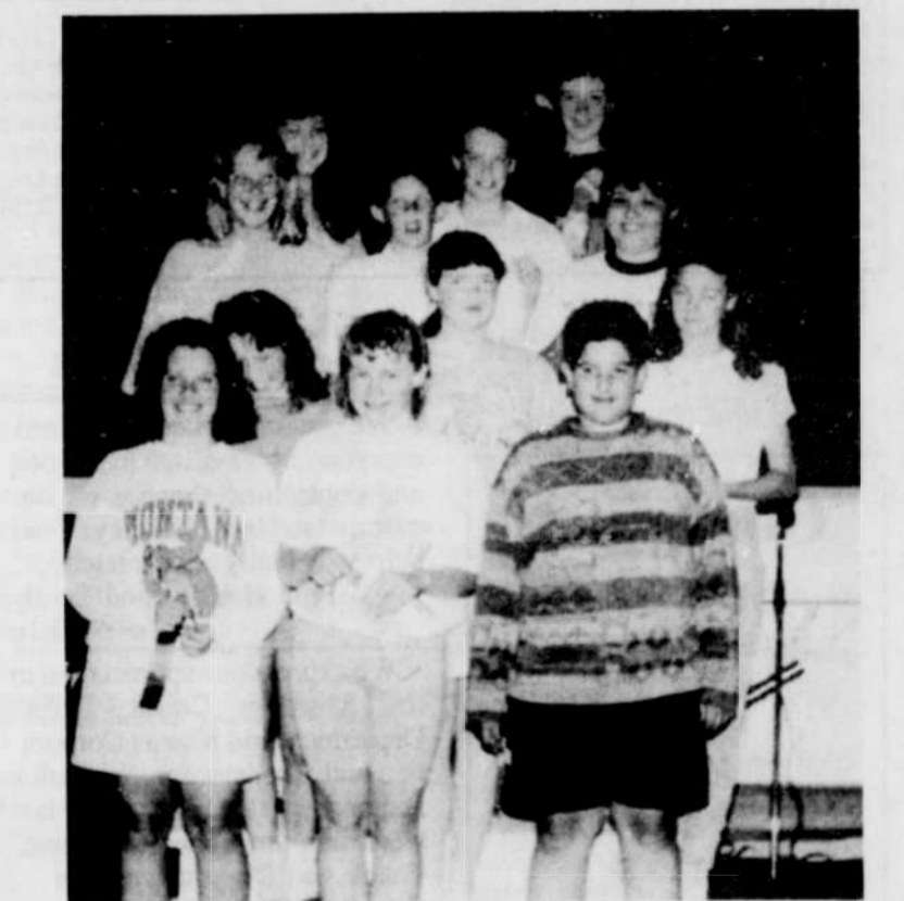
Sixth grade winners

The Morrow County School district has released the winners of the math contest for elementary and junior high age levels held recently. All participants received a ribbon and first place finishers in each grade received a plaque.