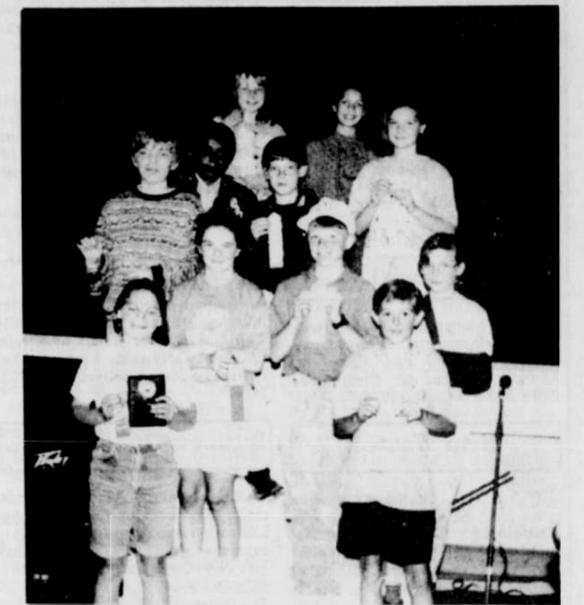
Fifth grade winners