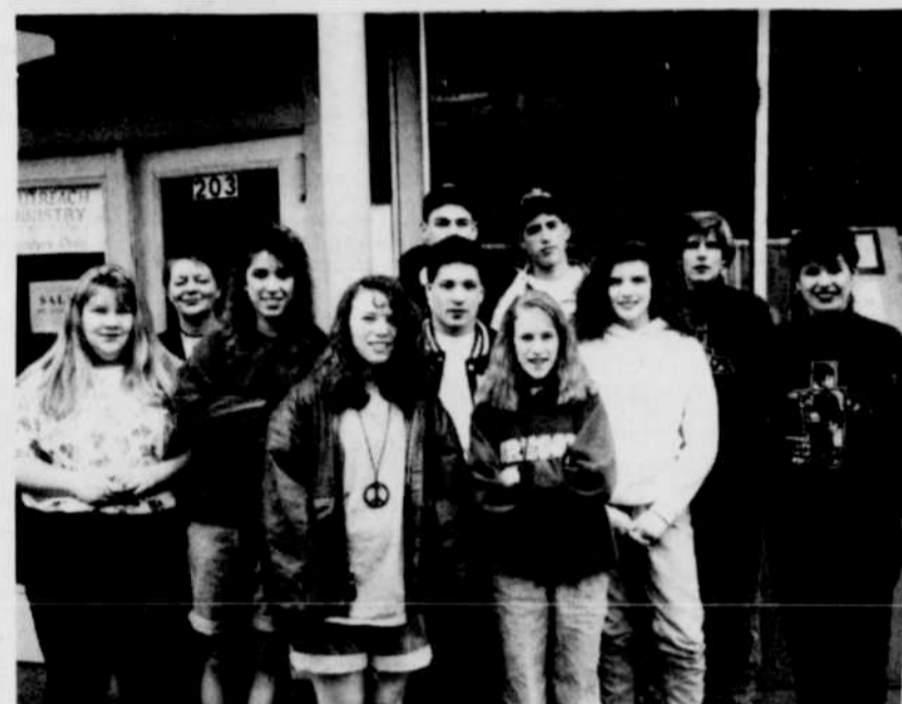
Ione youth group on Burnside

The group hit the road early Monday morning, leaving Ione at 6:30 a.m. Arriving on Burnside around 10 a.m. they were divided into three adult-led groups. The first morning was spent at Blanchet House, Loaves and Fishes and Sisters of the Road Cafe. After eating lunch at their respective placements, one group