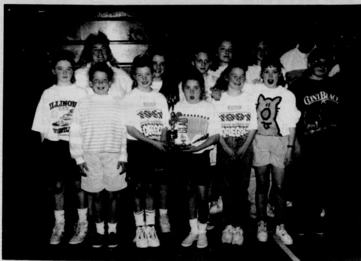
Girls fourth through sixth grade basketball team

A group of fourth through sixth grade girls attended the Hermiston Youth Basketball Association 1992 Invitational Basketball Tournament on March 15.