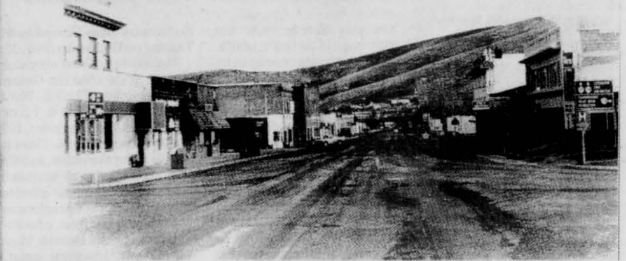
Computer altered photograph of Main Street without utility poles