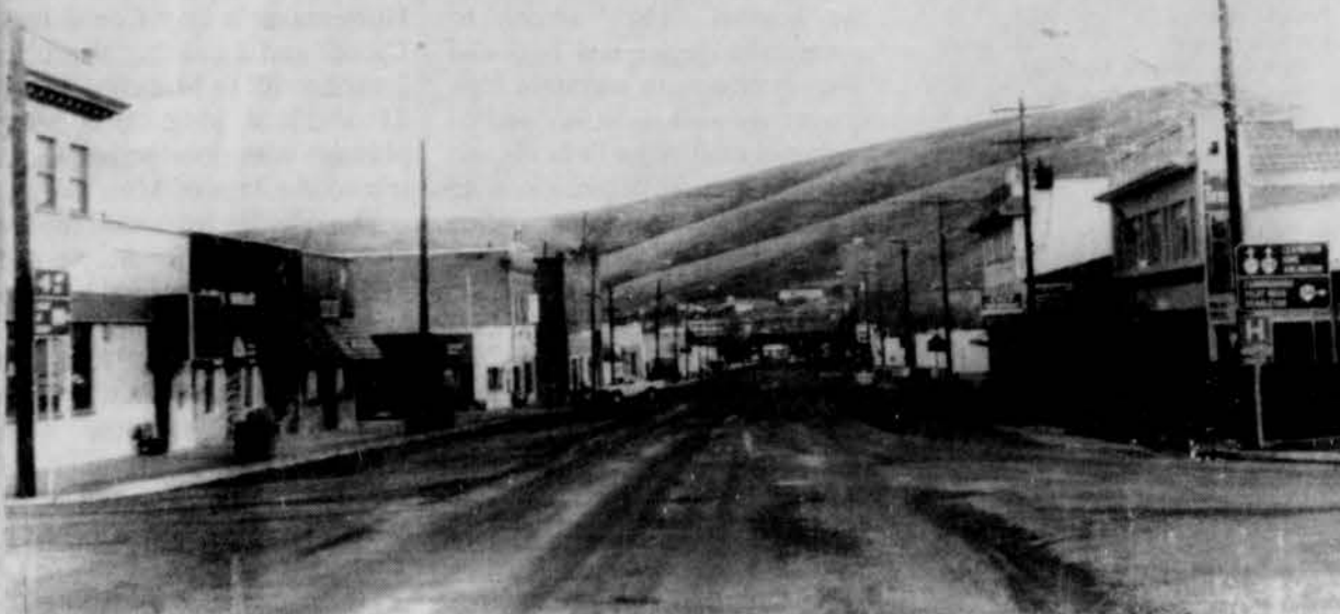
Main Street as it looks now with utility poles