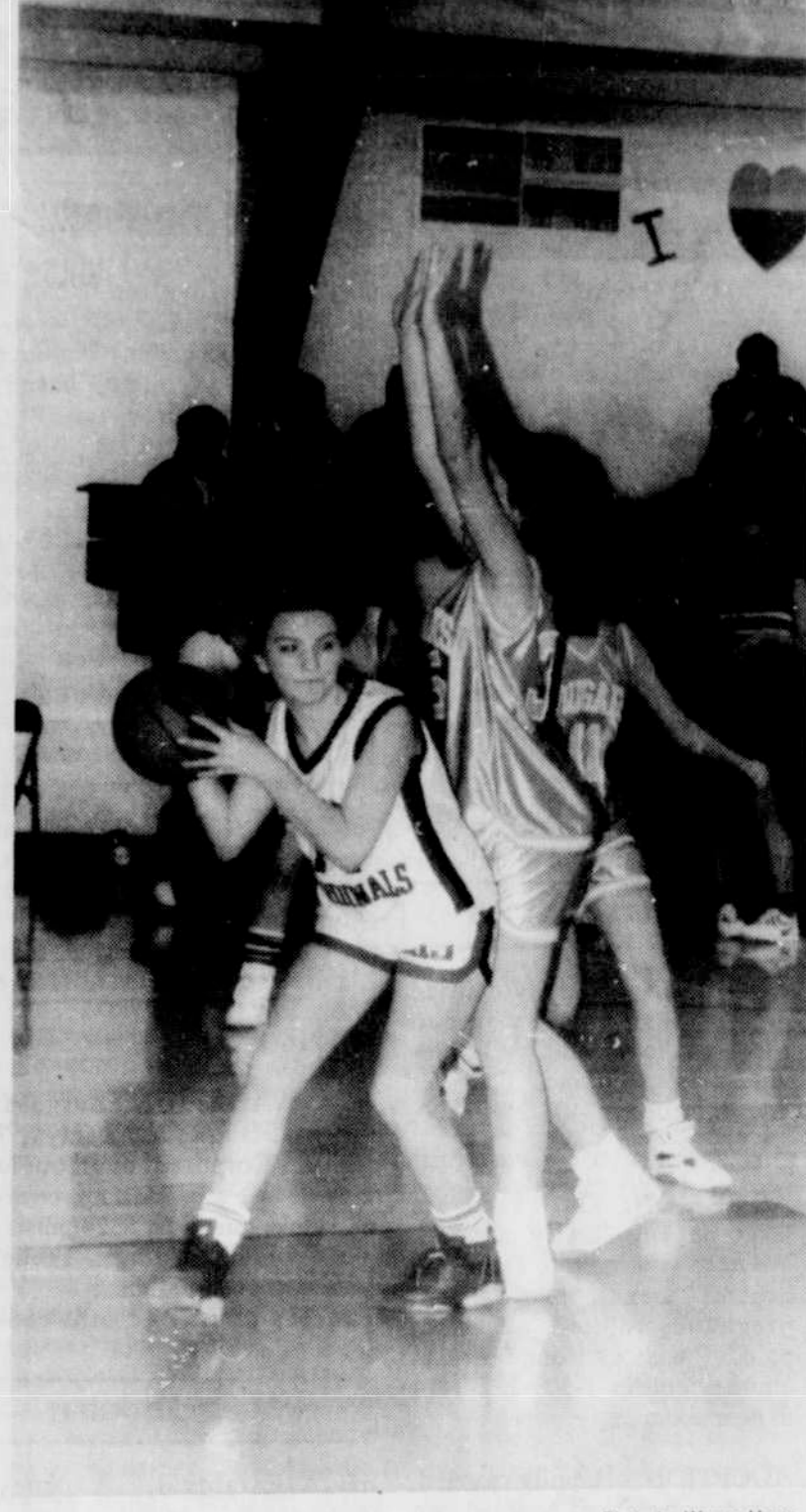
Lady Cardinal looks for playing room against Cougars

The lady Cards square off with Condon at Condon, this Friday in a crucial game for the Cards. Condon has established themselves as the team to beat by knocking off Sherman County last Saturday. On Saturday, the Cardinals host Culver.