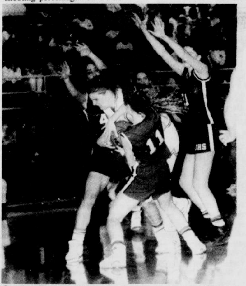
Condon Blue Devil tries to get through the Lady Cards