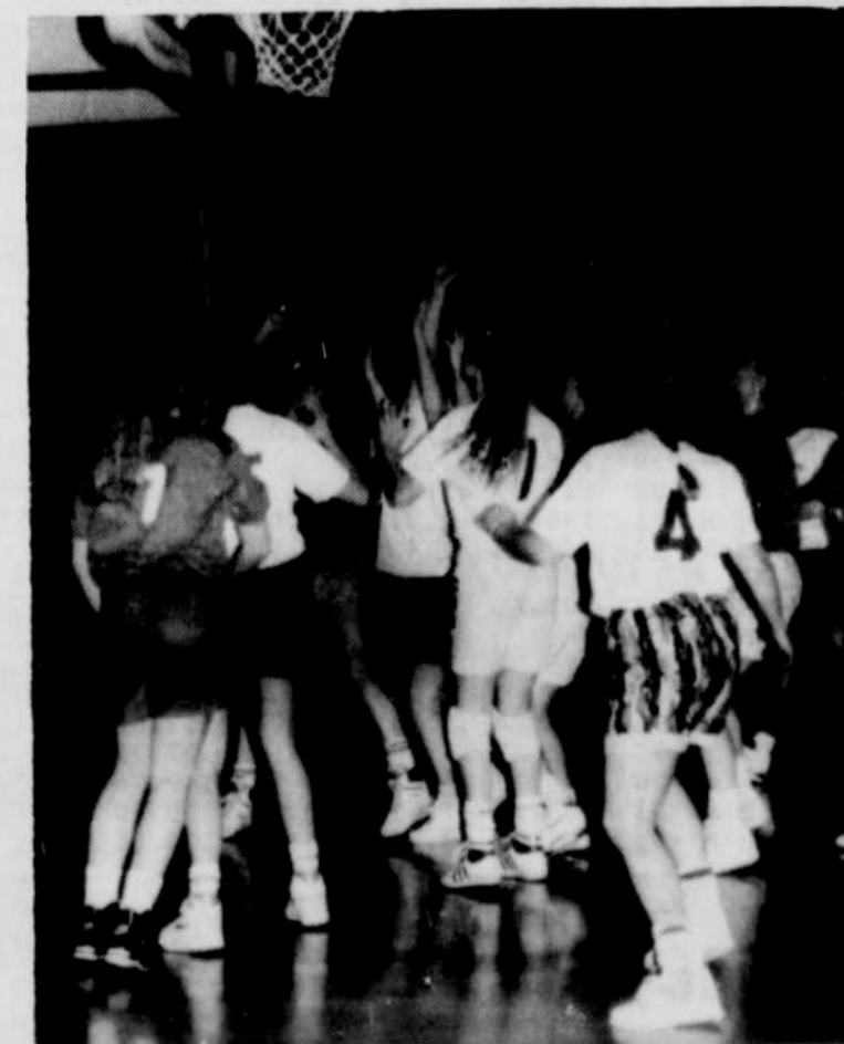
The women's teams will also compete